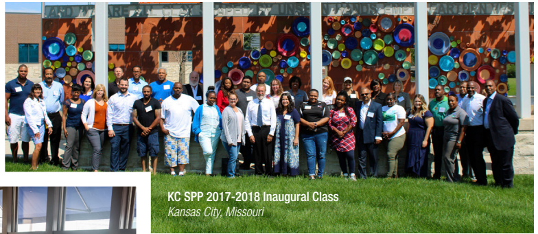
KC SPP 2017-2018 Inaugural Class Kansas City, Missouri