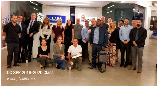
OC SPP 2019-2020 Class Irvine, California