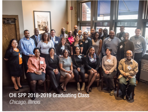
CHI SPP 2018-2019 Graduating Class Chicago, Illinois