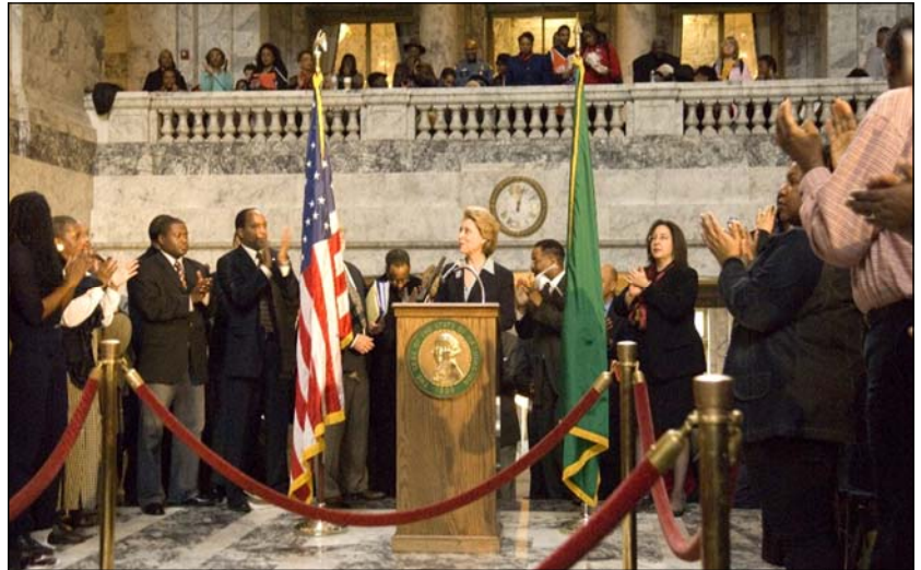
Tabor members join attendees in listening to Gov. Gregoire's greeting at the 2006 African American Legislative Day.

Tabor's Government Affairs Chairman Cos Roberts is keeping up with plans for economic stimulus proposals. The committee is drafting a letter to our state representatives to remind them not to overlook minority communities.