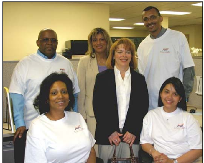
Members of the PMT team.