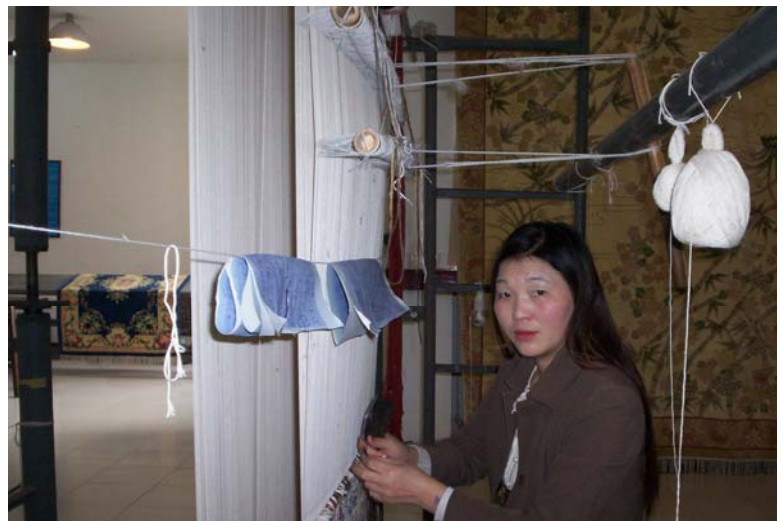
A Beijing carpet factory maintains the traditional arts of carpet weaving while also renovating and replacing some old equipment and techniques to enhance productivity and quality.