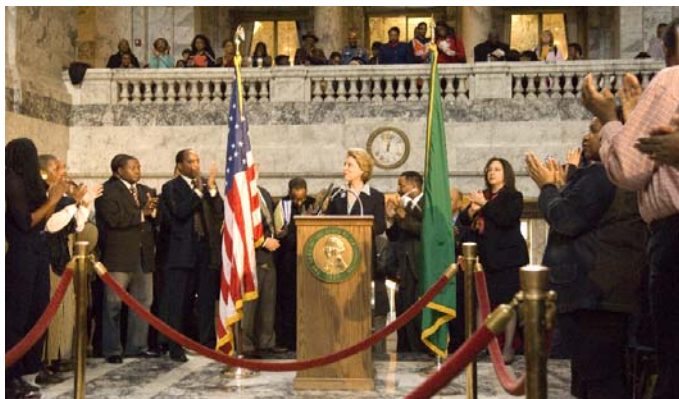
Gov. Christine Gregoire addresses attendees of the 2006 African American Legislative Day in Olympia.